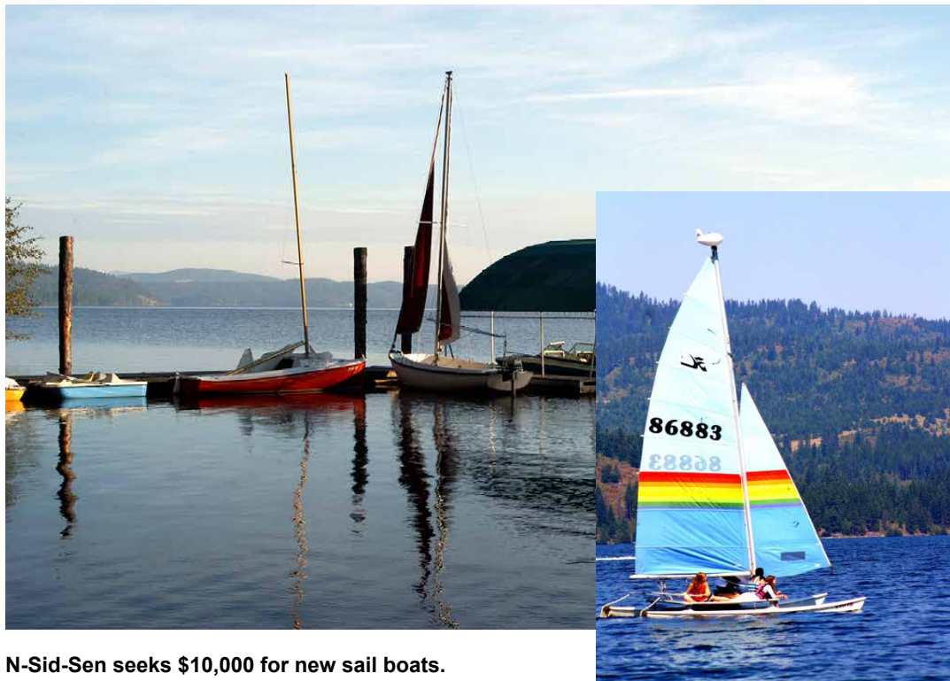
N-Sid-Sen seeks $10,000 for new sail boats.