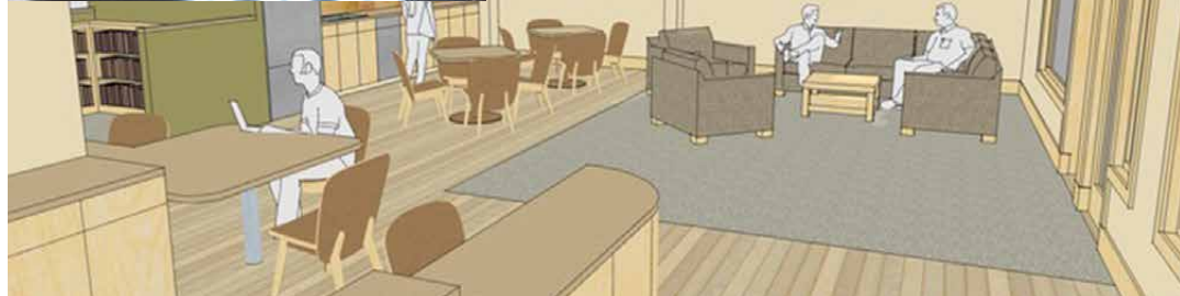
Bellingham First Congregational UCC renovates basement for Northwest Youth Services.