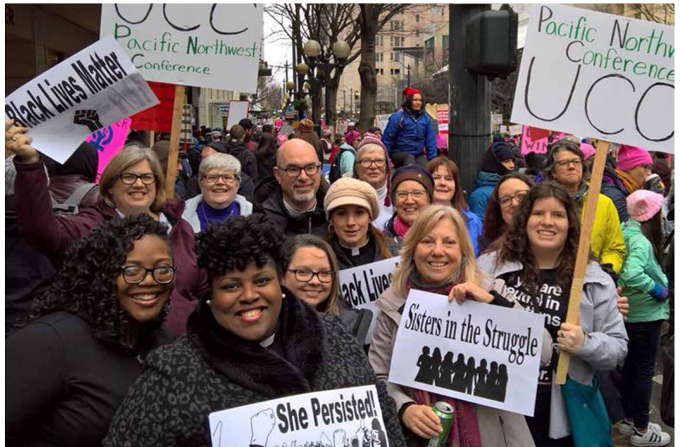
Members of the PNC Board and others from the PNC participate in Women's March.